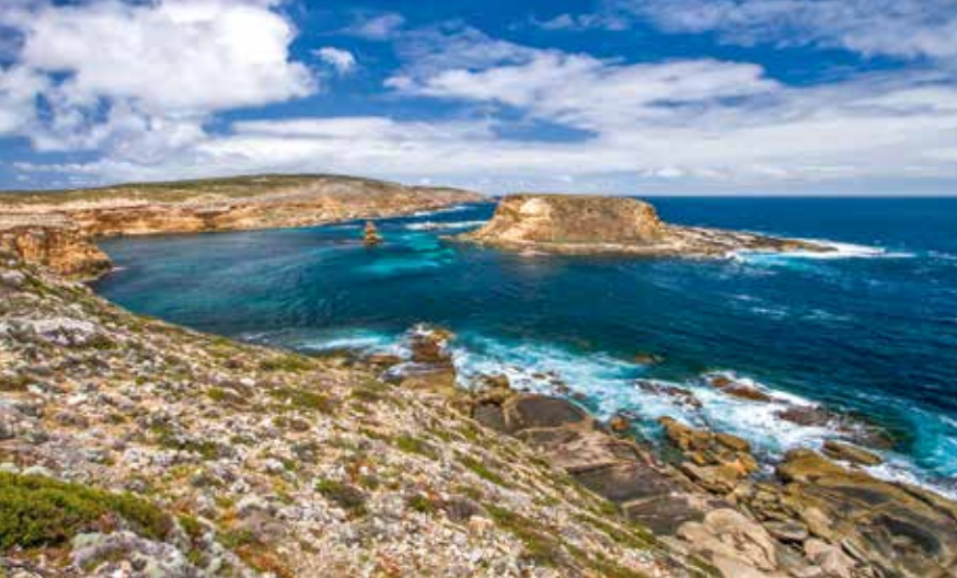
Top: Rugged coastline at Lincoln National Park.