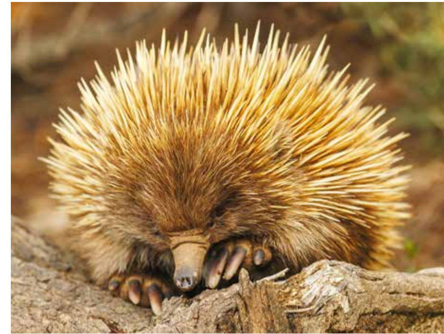
Above: A local Echidna keeps an eye on cruise visitors.

The adventure begins – especially for wine lovers – with a coach pick-up from the tour's hotel in the heart of Adelaide for a day of touring the famed Barossa Valley wine region. Wine has been a way