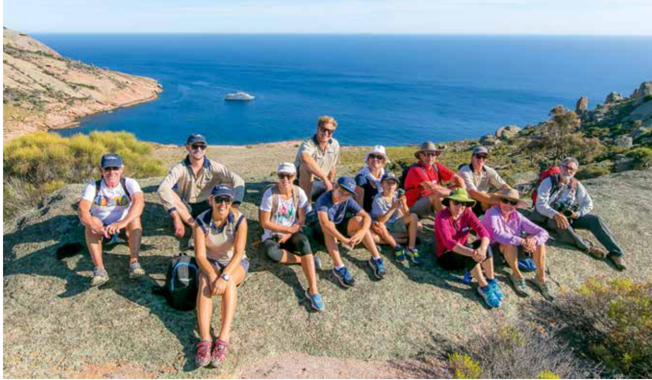
Above: A group of True North cruisers pose on Kangaroo Island.