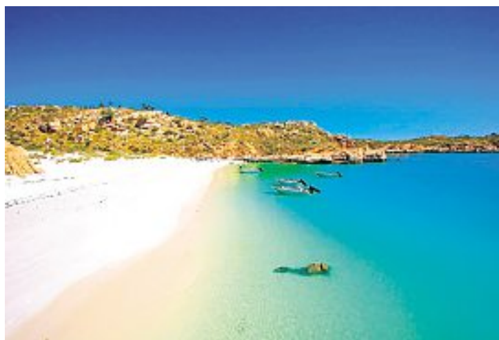
KIMBERLEY BEACH: One of the many pristine white sand beaches visited on the cruise.

Prices for the North Star Cruises seven-day Kimberley Snapshot cruise start from $9495 per person.