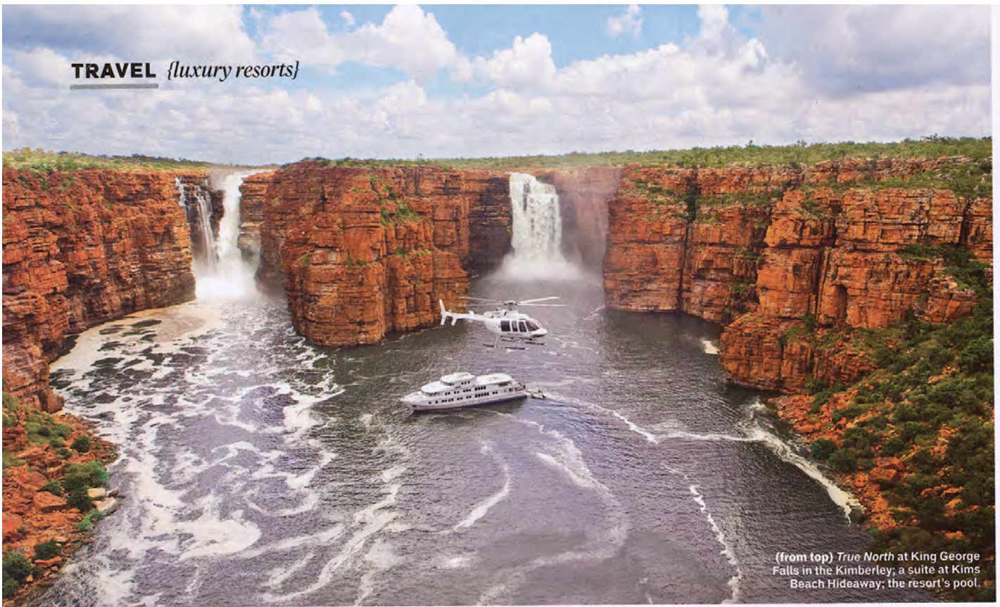
(from top) True North at King George Falls in the Kimberley; a suite at Kims Beach Hideaway; the resort's pool.